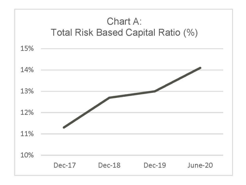
Chart A illustrates how we increased our total risk-based capital to above 14%, a record high for Parkside, nearly 50% above levels considered well-capitalized by the regulators.

First, we built our capital and loan loss reserves to all-time highs. Our balance sheet has never been stronger and more capable of handling the unknown; everything from a severe downturn with increased loan losses to a strong rebound resulting in unusually rapid loan and client growth. Either way, we are ready. Charts A and B show how we further strengthened our balance sheet to prepare for the uncertainty ahead.